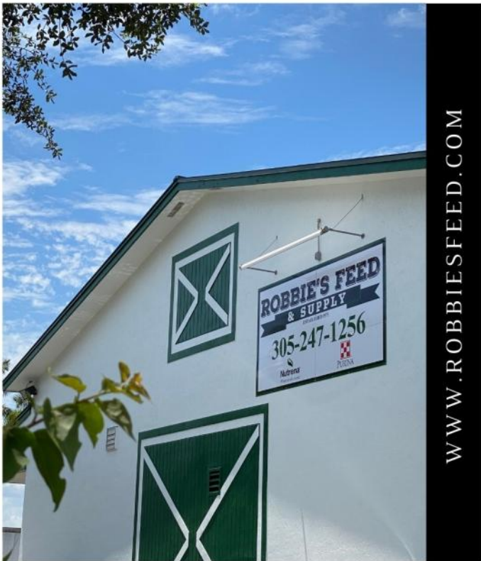
22390 SW 177 Avenue, Miami, FL 33170 | 305-247-1256 Store Hours: Monday - Saturday | 8:00 am - 5:30 pm