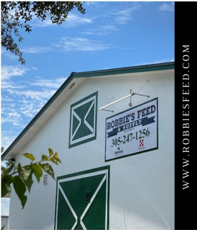
22390 SW 177 Avenue, Miami, FL 33170 | 305-247-1256 Store Hours: Monday - Saturday | 8:00 am - 5:30 pm