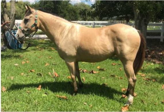
Quarter Horse Type • Mare Buckskin • 15.0 hh • 2004 est YOB

Glory has made fantastic progress since we rescued her, as you can see in the photos. What you can't see is her confidence and trust which is getting better each day. This beauty is housed in a cozy stall, getting everything she needs to make a full recovery. We have only recently made Glory available to adopt, and note that given her condition we have not tried her under saddle so her training and rider suitability is unknown at this time.