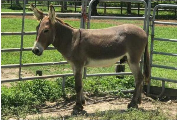
Donkey Gelding • Gray • 2016 est YOB

Mr. Bo Jangles is friendly with people, and semi-halter broke. Has been around sheep, goats, cows & pigs (but please note he's not trustworthy around dogs). Has been bathed before.