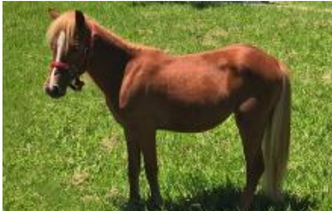
Mini • Filly • Chestnut • 2016 est YOB

Flor was rescued with 5 other horses from the 8.5/East Everglades in SW Miami-Dade on June 28, 2017. She and the others were unconfined/at large, posing a danger to themselves and the public. Charges have been filed by police against the owner.